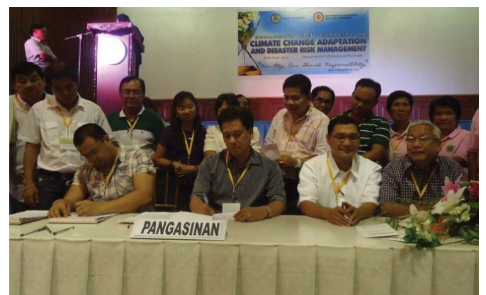
The DILG and the participants sign a Memorandum of Agreement to strengthen their commitment to the project "Enhancing the LGU Capacity on Climate Change Adaptation and Disaster Risk".