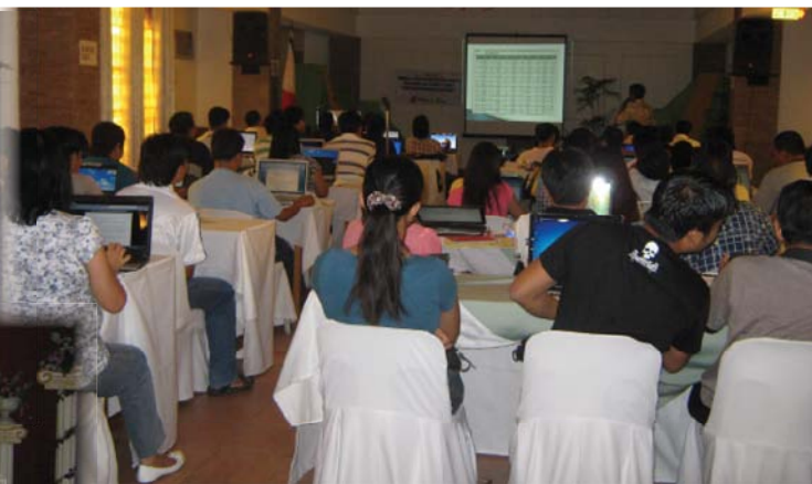
(above) Ilocos Norte participants navigate the GIS software and its application to various hazard map preparation.