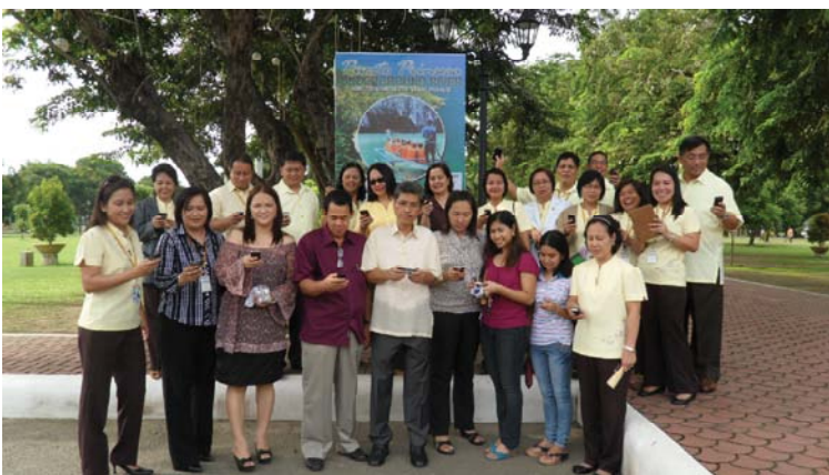
DILG Pangasinan personnel along with the Department Heads of the Provincial Government vote thru text during the campaign launch of the PPUR-N7WN.