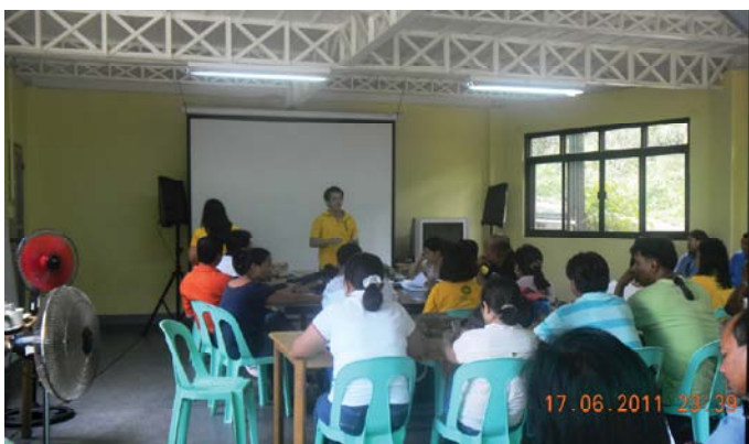
DILG Ilocos Sur visits the municipality of Alilem.