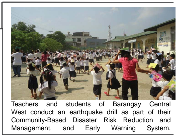
Teachers and students of Barangay Central West conduct an earthquake drill as part of their Community-Based Disaster Risk Reduction and Management, and Early Warning System.