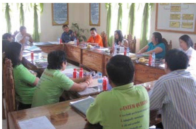
The Regional SGH Team visits Sarrat, Ilocos Norte and Qurino, Ilocos Sur for the 2011 SGH validation visits.